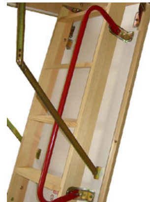
Titan Metal Handrail Ref: TDE27M