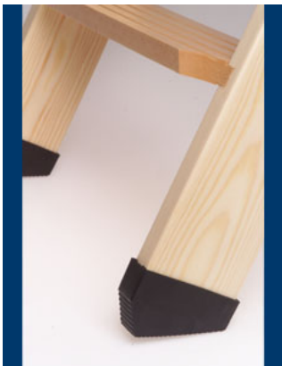
Titan Hobby Feet Ref: TDH29F