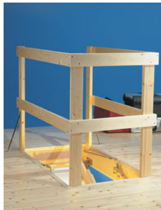
Timber Balustrade Ref: TLB01