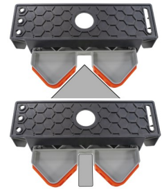
Inside & Outside Corner