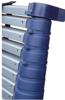
Built in wall standoff

150kg LOAD CAPACITY (Load includes user, Tool, Materials etc)