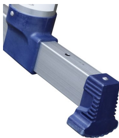
Automatic deploying stabiliser bars