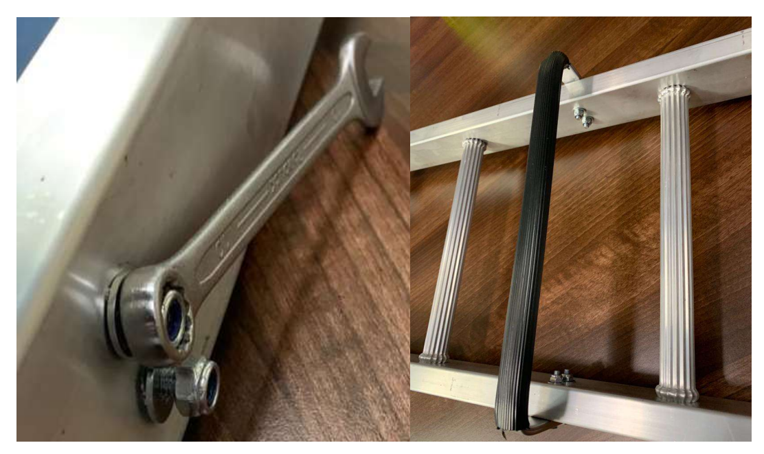
Step 5 – Repeat Steps 1 to 4 for each Bearer Bar provided. Ensure that all bearer bars are assembled correctly before using the roof ladder.

Please contact Sales/Customer Services where an instructional video can be provided upon request. Please contact <a href="mailto:sales@lyteladders.co.uk">sales@lyteladders.co.uk</a> or call 0n 01792 796666.