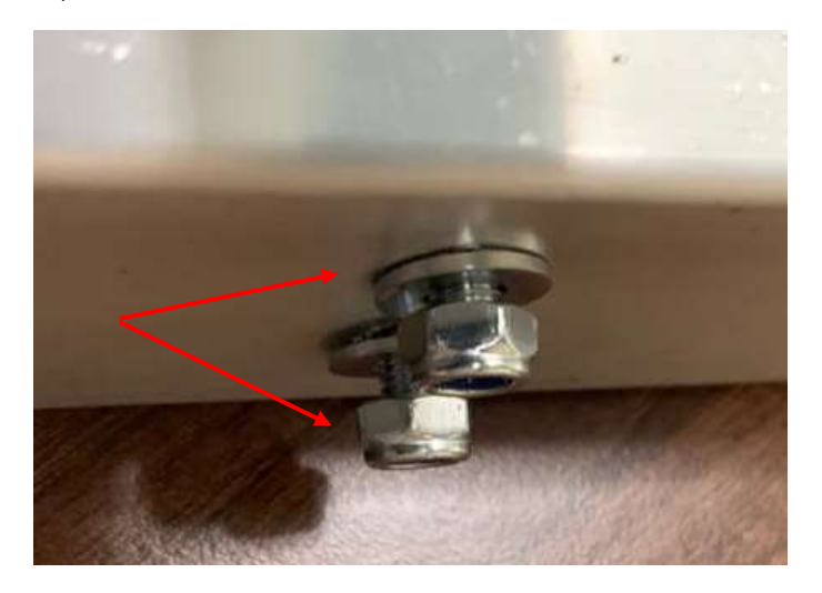
Step 4 – Using 2 10mm spanners (not supplied), place a spanner on each end of the nut and bolt and tighten. Be mindful not to over tighten. Tighten all 4 nuts and bolts and check that the bearer bars are not loose and do not move. Please see photograph below;